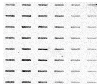
Western Blot of serial diluted protein samples transfer to NC membrane