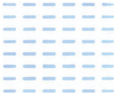
Protein sample transfer to PVDF membrane

This vacuum blotting apparatus with unique wells edge design offers an effective sealing that prevents cross-contamination between wells, producing high quality blots, simple and convenient method for screening recombination clone, protein, and DNA / RNA, up to 700 \mu l per well volume for sample loading results are easily qualified by scanning of densitometer. Main unit is autoclaveable, and screw-free design is for easy assembling.